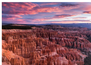
Bryce Canyon Nat'l Park

Trip Cancellation & Interruption Insurance available. Ask us for details or see our website.