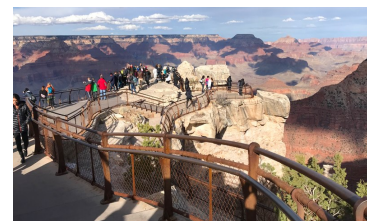
South Rim of Grand Canyon

Wed., April 15: Grand Island, NE We will depart on this spring motorcoach tour to Las Vegas and the majestic canyons of the southwest. Our first days journey takes us to Grand Island, NE , located in south central Nebraska.